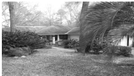
3 Bedrooms, 2 Baths, 2-car Garage 1,919 sf la—Priced at $155,000 Call Dave Farrell A/005