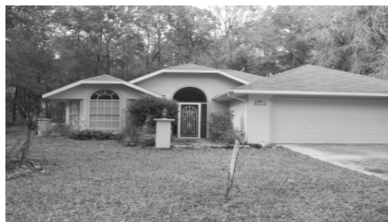
2 Bedrooms, 2 Baths, 2-car Garage 1,556 sf la—Priced at $169,900 Call Janet Pigeon 161/012