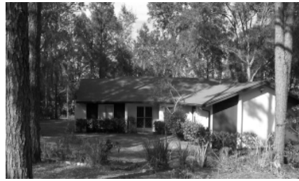
3 Bedrooms, 2 Baths, 2-car Garage 1,821 sf la—Priced at $169,000. Call Janet Pigeon 099/026