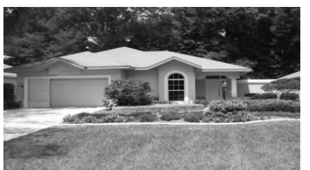
2 Bedrooms, 2 Baths, 2-car Garage 1,218 sf la—Priced at $198,000 Call Yulee Commander S/005

Rainbow Springs Community Realty, Inc. only lists and sells properties in Rainbow Springs. If you want more showings on your home, call us at 352-489-2525. We are open 7 days a week and have sales associates on duty every day.