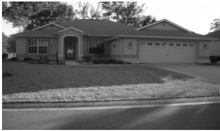
3 Bedrooms, 2 Baths, 2-car Garage 1,966 sf la—Priced at $264,000. Call Sharon Graley FTA/023