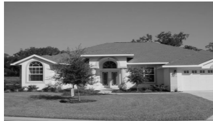
3 Bedroom, 2 Baths, 2-car Garage 2,233 sf la—Priced at $271,300 Call the Sales Office GPN/044