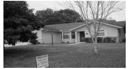
3 Bedrooms, 2 Baths, 2-car Garage 2,046 sf la—Priced at $189,900 Call Carole Caird E/017