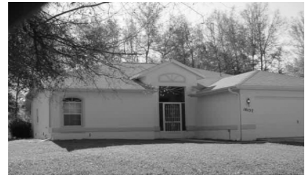
2 Bedrooms, 2 Baths, 2-car Garage 1,489 sf la—Priced at $135,000. Call Earl Riis 176/005