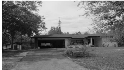
2 BR., 2 BA., 2-car Garage, Pool 1,543 sf la—Priced at $120,000 Call Yulee Commander 132/010